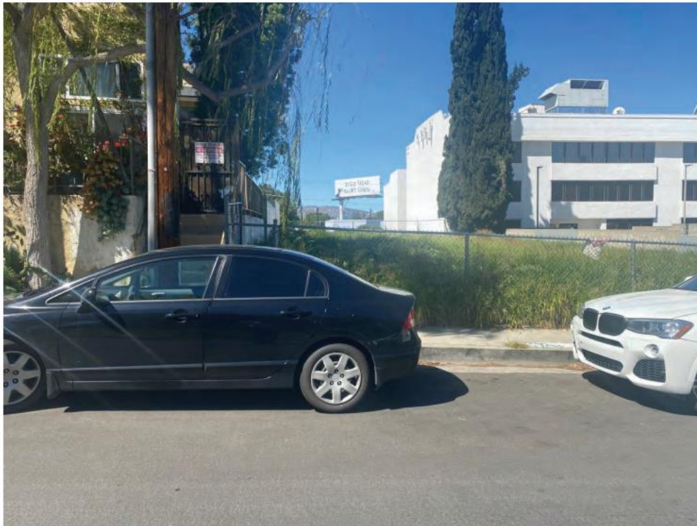
5 / South West Corner

Address: 22949 W DEL VALLE ST APN: 2042006075