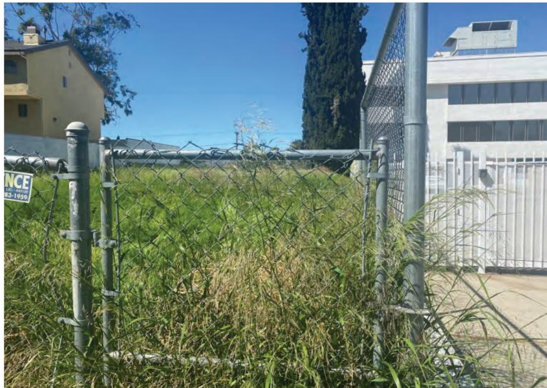
6 / South West corner along Del Valle