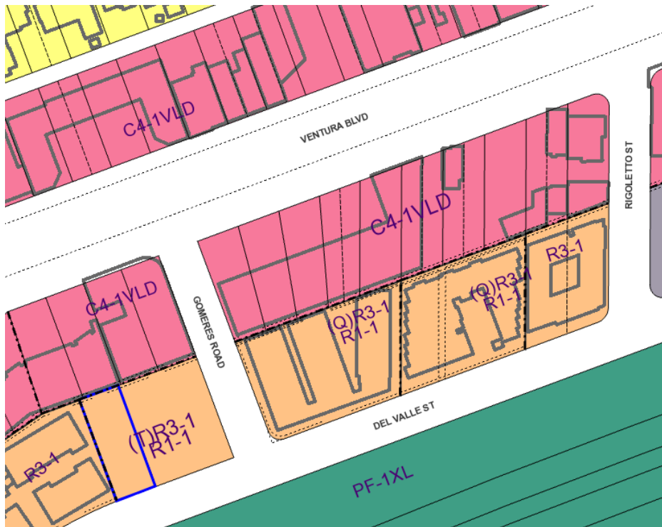
Zimas / Zoning Map