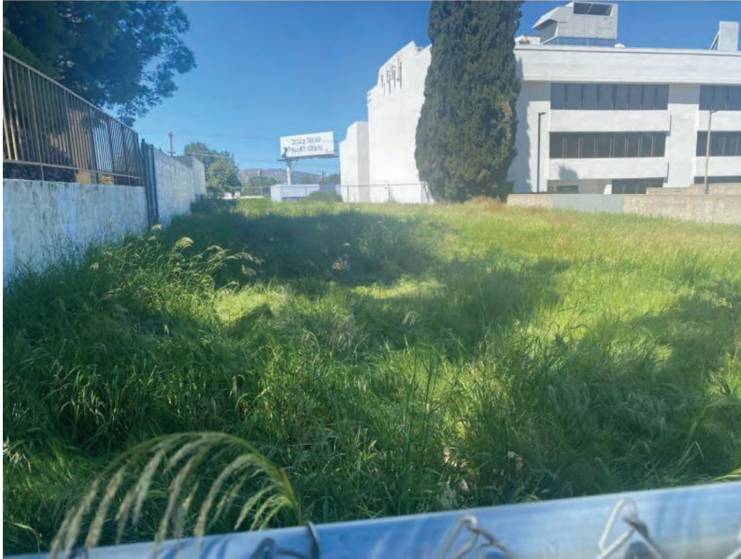
3 / South side – Full view of lot looking north along Del Valle