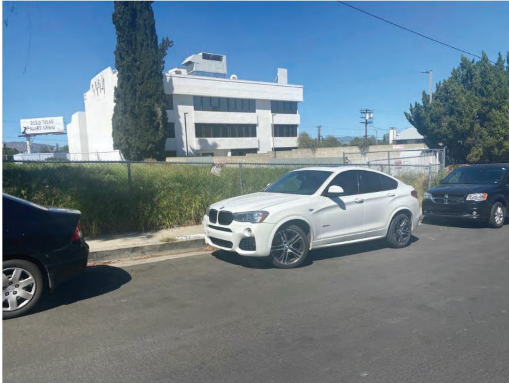
1 / South side along Del Valle