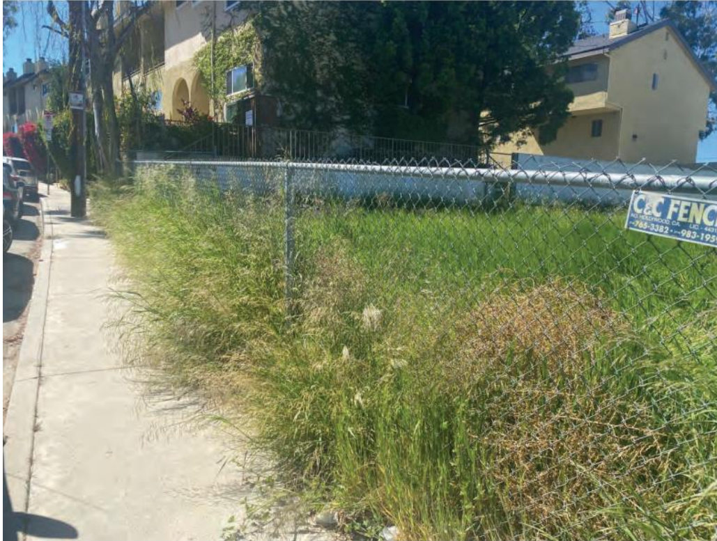
7 / South side – Full view of Path Of Travel walking west along Del Valle