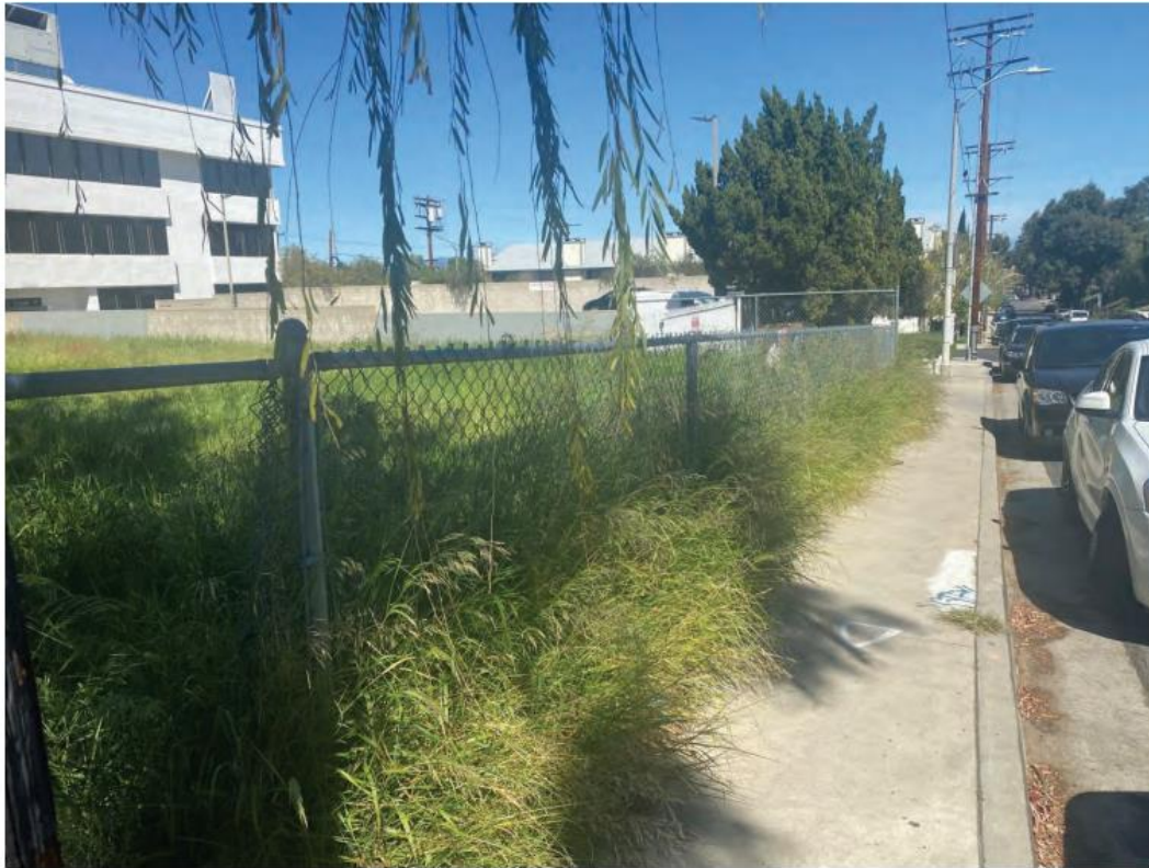
4 / South side – Full view of Path Of Travel walking east along Del Valle