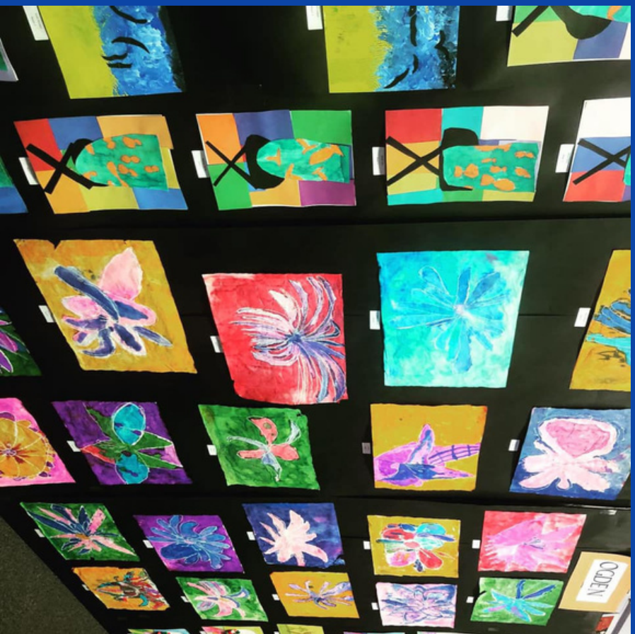
Art gallery wall

23231 Hatteras St. Woodland Hills, CA 91367