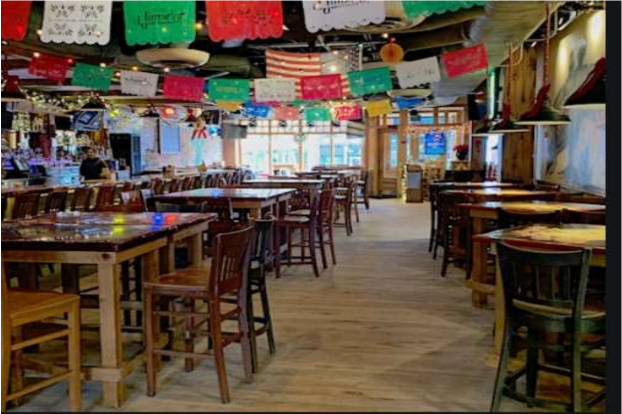
One of the indoor seating areas