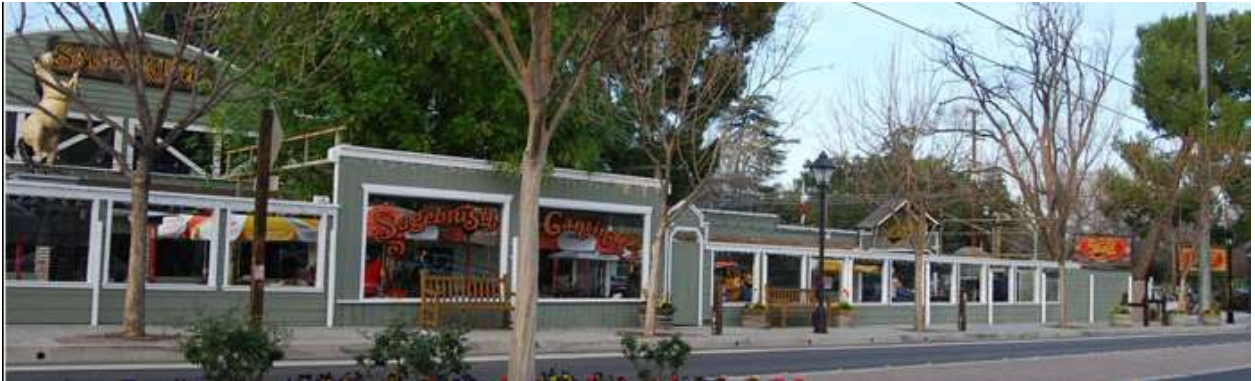
View of Sagebrush restaurant fronting Calabasas Road.

PLUM Case Leader: Martin Lipkin: E-Mail: martinlipkin@yahoo.com