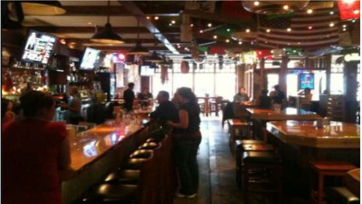
View of bar area