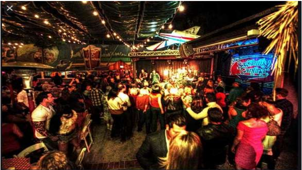
Stage and dance floor area