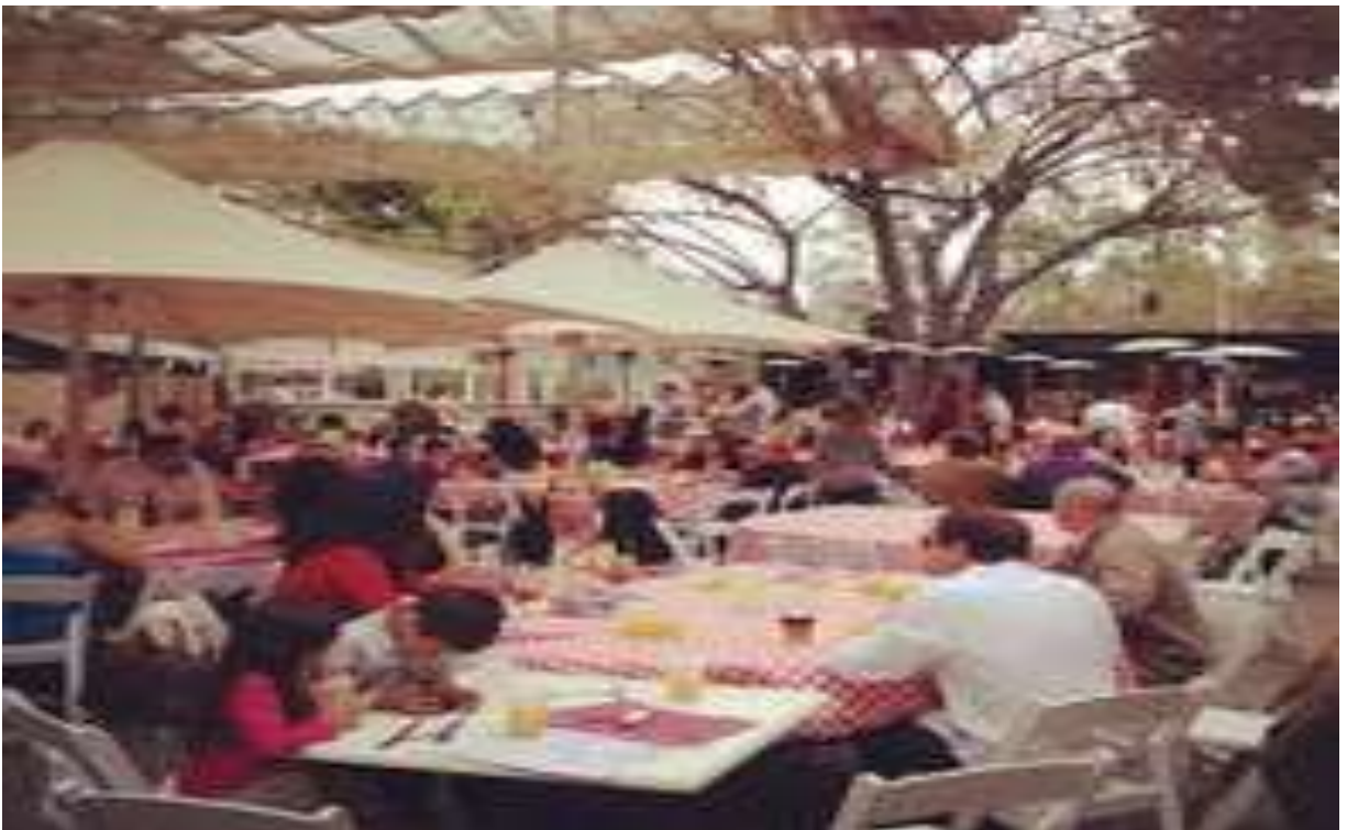
Outdoor patio(s) area