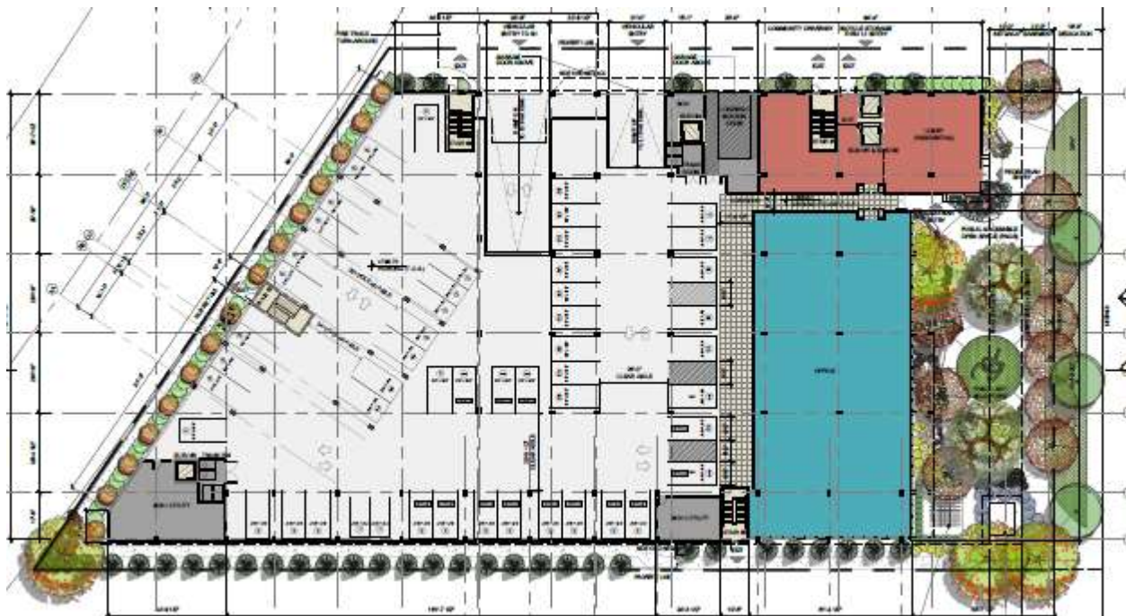
First floor layout with “full” commercial office space indicated in blue and some of the common space area in red.

Additionally, while the original plans contained significantly more space designated for satisfying the non-residential space requirements of the Specific Plan, this new/ revised submission has eliminated 315 SF of the “real” commercial space (office space) that the Plan intended to bring jobs and potential customers into Warner Center to balance the residential additions to the area, and instead is using a “loop-hole” approach to satisfy the 2035 Specific Plan by relying on the allowed “Common areas” and 50% of the Live/Work units to make up more than half of the space the Specific Plan envisioned for “real” commercial ventures.