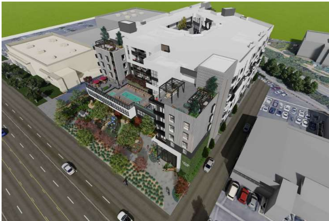
Aerial perspective of proposed structure and adjacent buildings.

The roof materials are SR-1 (or better) to deflect some heat. There are no solar panels indicated, although the roofs must be--and are--outfitted to accept future solar use.