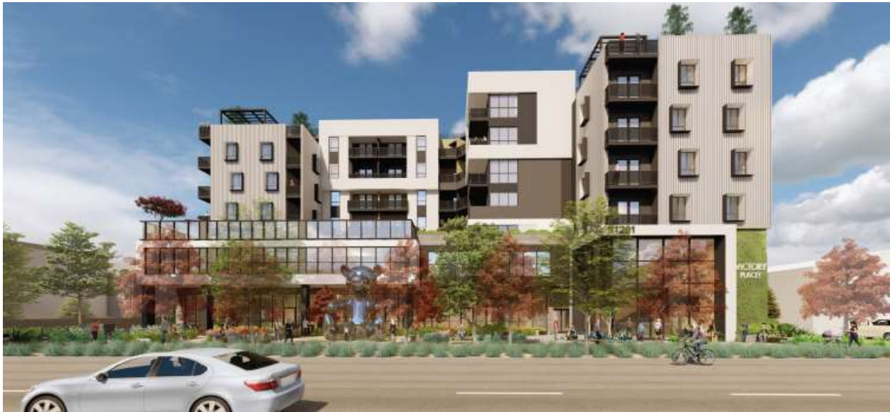
Street view of front PAOS garden area and swimming pool on second floor.

Heat generation, retention, and reflection are areas of concern. There is no indication that the walkways and court areas are using Cool-Crete technology or that steps have been taken to reduce any heat island impacts. As mentioned before, the addition of solar panels to the roof would also be a step forward in reducing energy impacts to the area power grid.