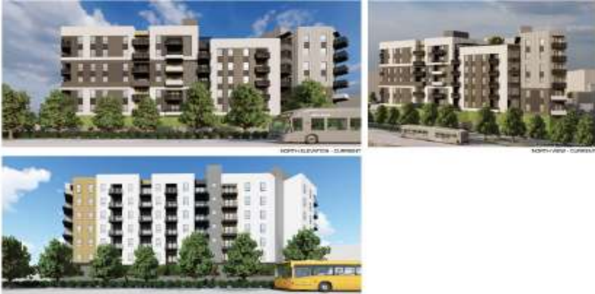
Rear (North) elevation of new design and prior design

The roof materials are SR-1 (or better) to deflect some heat. There are no solar panels indicated, although the roofs must be--and are--outfitted to accept future solar use.