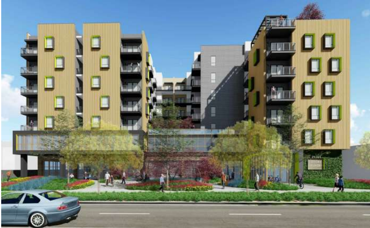
Original proposed structure had two 6-story “wings opening to Victory and a larger commercial office section. The rest of the building rose 7 stories.

One of the main architectural features was the green window-box frames around staggered windows, while the two south façade “wings” created a deep central elevated courtyard. The two “wings” were 6-stories high while the rest of the structure rose to 7-stories. The original proposal called for 244 residential units and the majority of the first and second levels were projected for 16,825 SF of office space that was set off by full-story windows. The total overall appearance of the design created a structure that building appeared bulky and insignificant to the PLUM Committee. One of the major features of the original design was the inclusion of mechanized parking to increase efficiency and room, which has been eliminated in the current design.