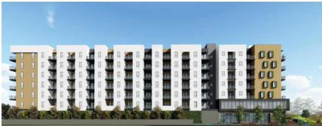
New design West façade (top) and previous design (bottom).