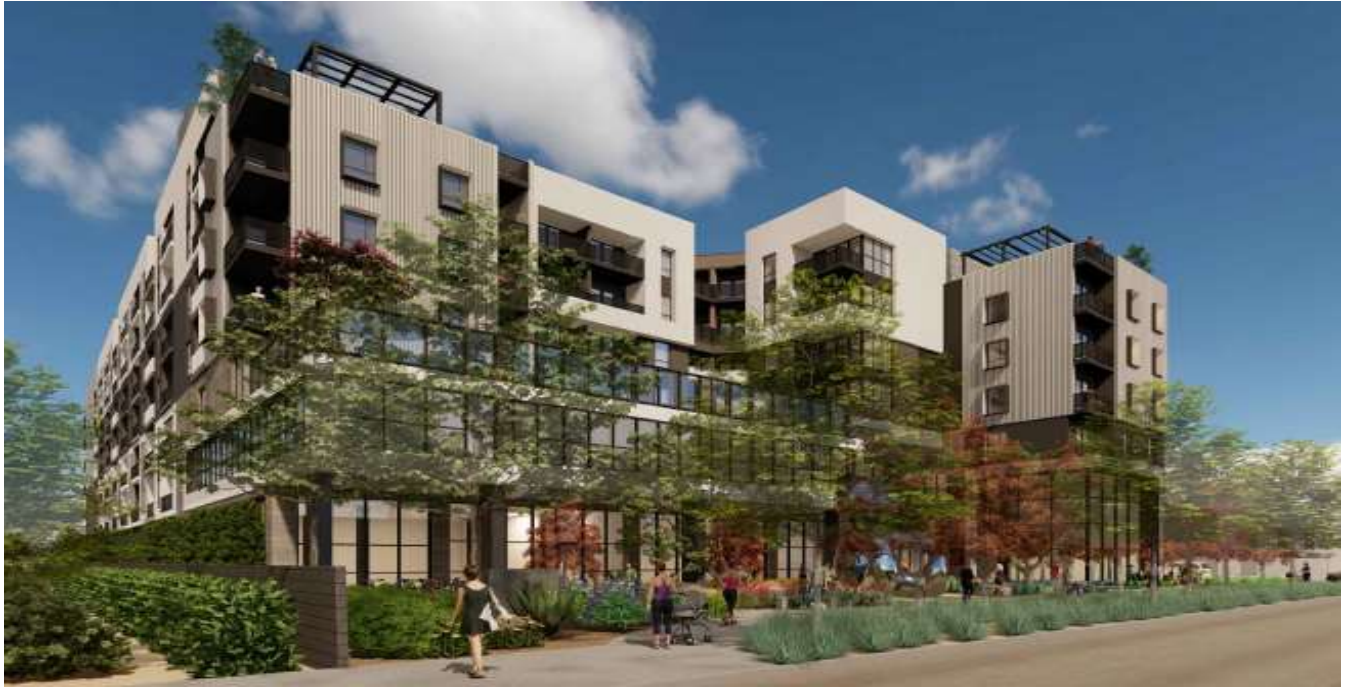
Front (south) and west facades showing architectural approach.

Warner Center and are quickly becoming a design cliché for many architectural submissions in Los Angeles.