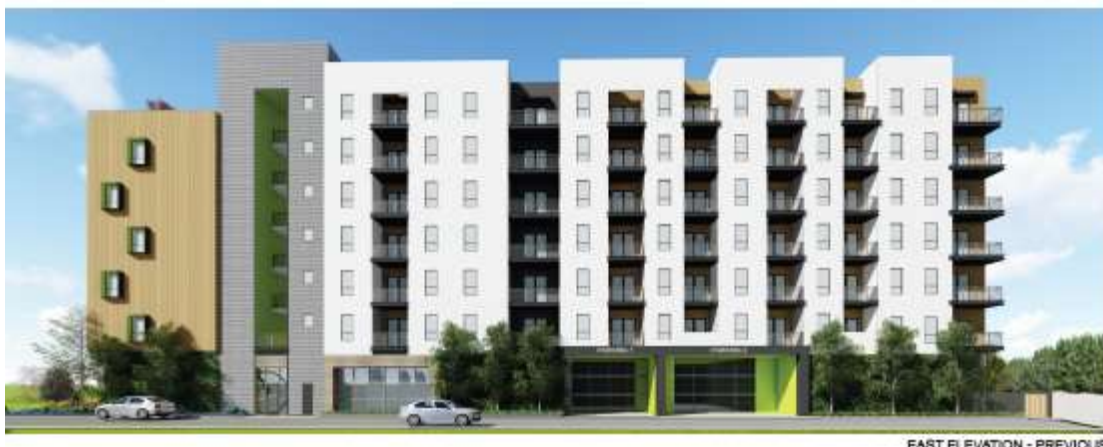
New design East façade (top) and previous design (bottom).

to be an oxymoron in that those units are not serving as real commercial sites that are supposed to provide multiple job opportunities for residents of Warner Center, and are quietly being offered as residential sites only for developers who have failed to make the Live/Work attractive enough or functional enough to attract businesses that actually help balance the residential/commercial requirements envisioned for the 2035 Warner Center Specific Plan. Additionally, there is no signage plan to identify the proposed Live/Work units as “commercial businesses” for anyone driving past on Victory Blvd.