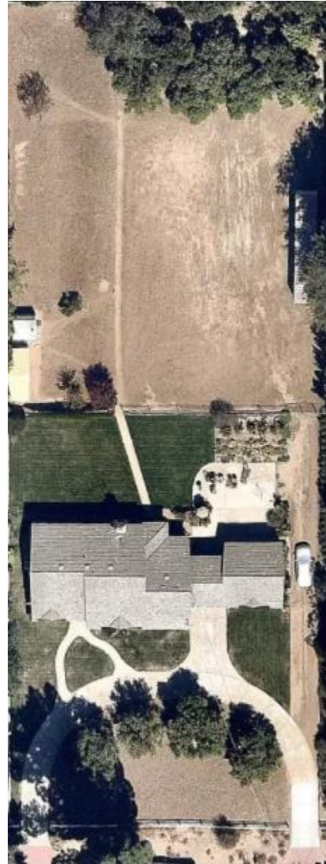
Views of Property at 23133 Oxnard Street

The applicant proposes to subdivide an approximately 37,384 sqft. RA-1 zoned lot into 2 lots creating a flag lot in the rear. The preliminary parcel map provided by the applicant shows the area of the front lot to be 17,500 square feet, and the area of the rear flag lot to be 17,731 sqft. when the subdivision is completed.