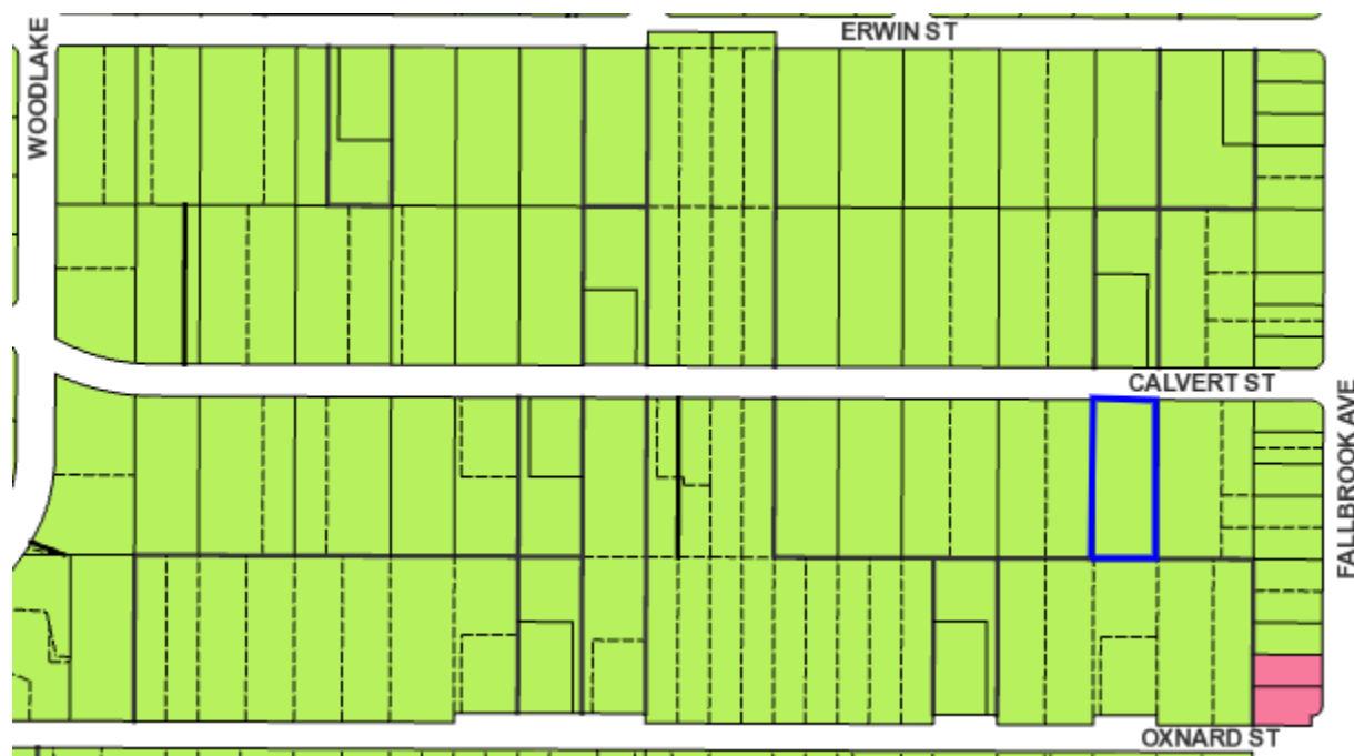
Location of Site and Surrounding Properties

The project is located on the south side of Calvert Street between Woodlake Avenue and Fallbrook Avenue in a very low density community of large RA-1 zoned lots locally known as Walnut Acres. The map below shows three properties sharing lot lines with the project site, and other surrounding properties.