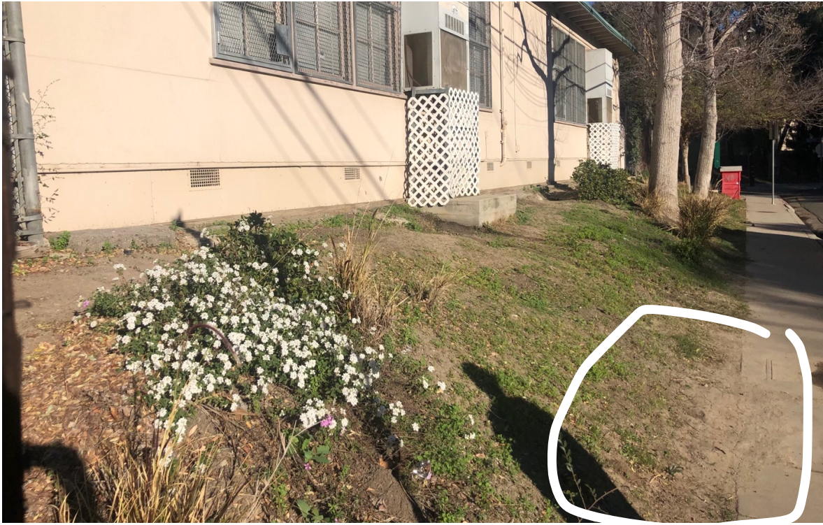
Another depiction of how dirt slips into walkways