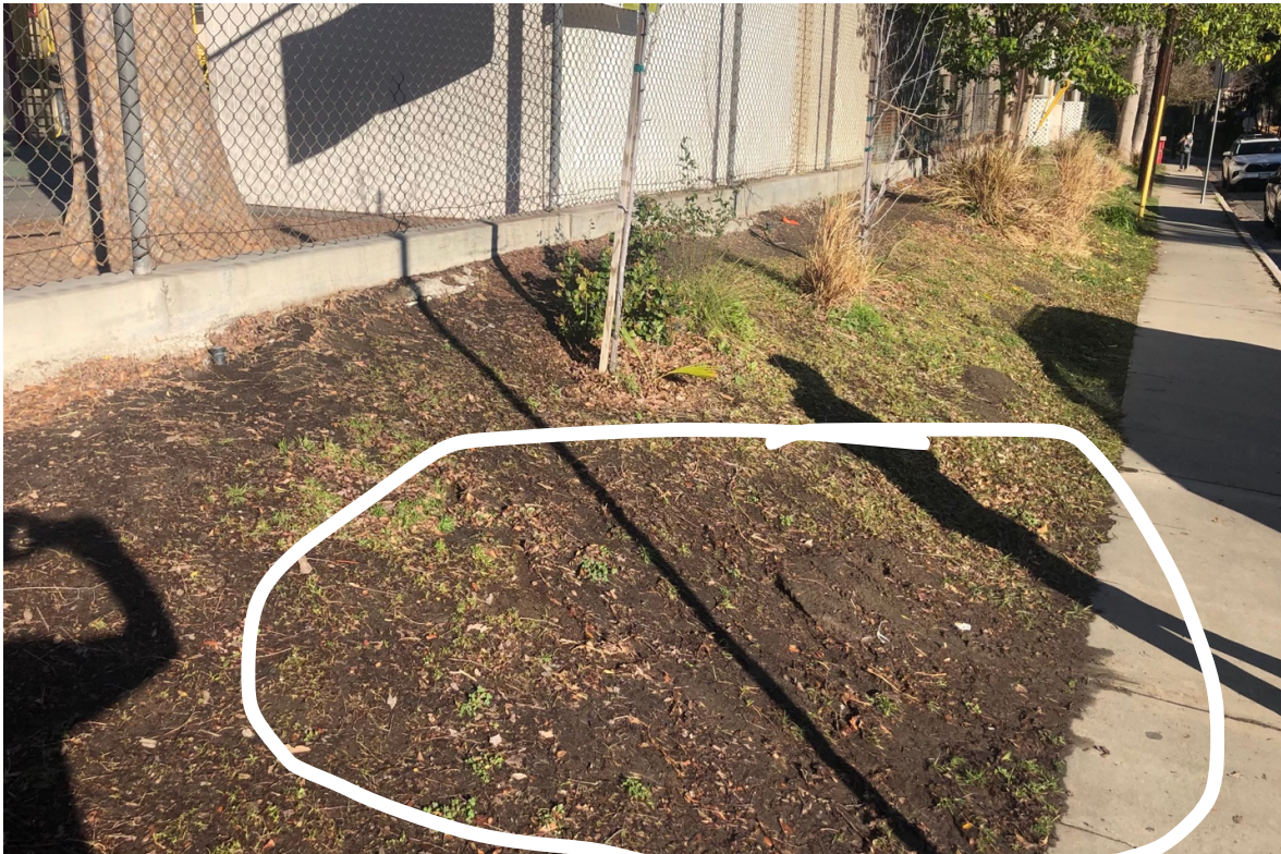
Notice bare dirt and dirt seepage onto walkways