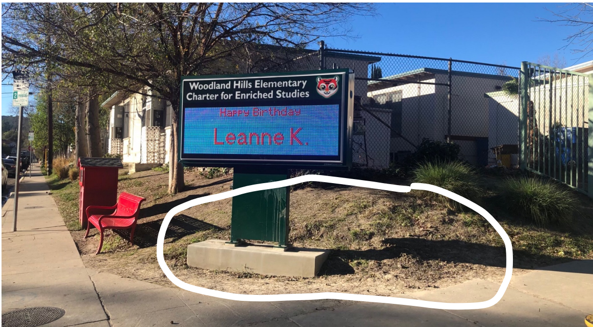
Dirt surrounding our new marquis needs beautification