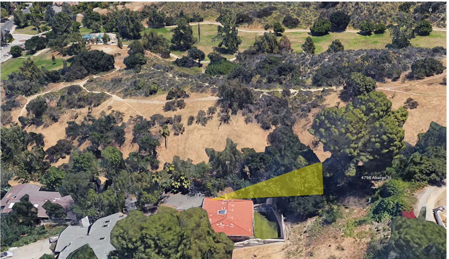
Serrania Parkland is the top part pictured below