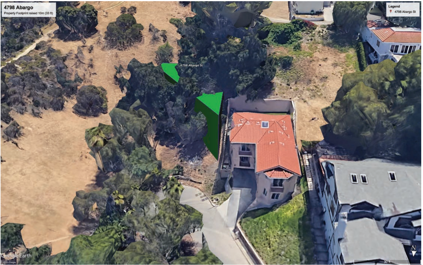
Approximate project property elevated 10m or 33ft relative to adjacent property.