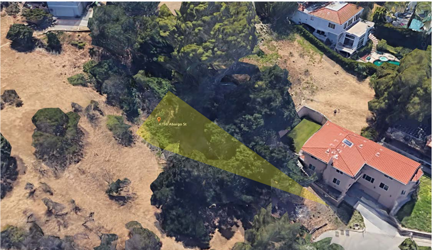
Approximate site of project is highlighted.