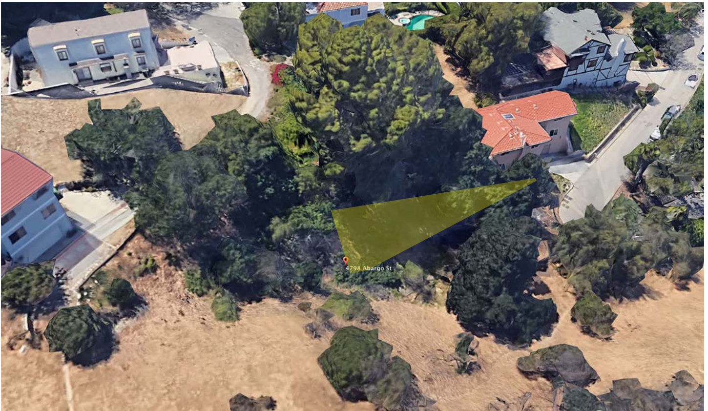
Properties to the south are higher than the project approximately located as highlighted.